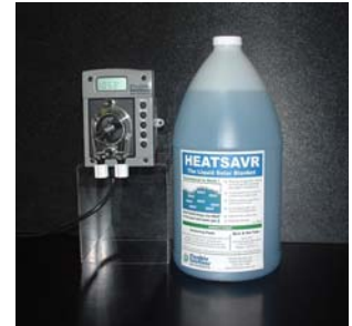
Heatsavr liquid and pump.

Heatsavr is guaranteed to save energy and water in every pool. Energy savings up to 40% can be expected. The reduction of evaporation and humidity in indoor pools also lowers the cost of air conditioning and structural maintenance.